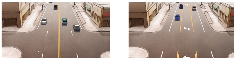
Fig. 1. 4-to-3 lane conversion example (Used with permission © Iowa Department of Transportation).

An emergency responder survey was created to identify perceptions and experiences of emergency responders who interact with lane converted roads. This study provides important context on the person-level interactions of EMS with 4-to-3 lane conversion sites. The survey was reviewed and approved by the University of Iowa Institutional Review Board, and informed consent was obtained from all participants.