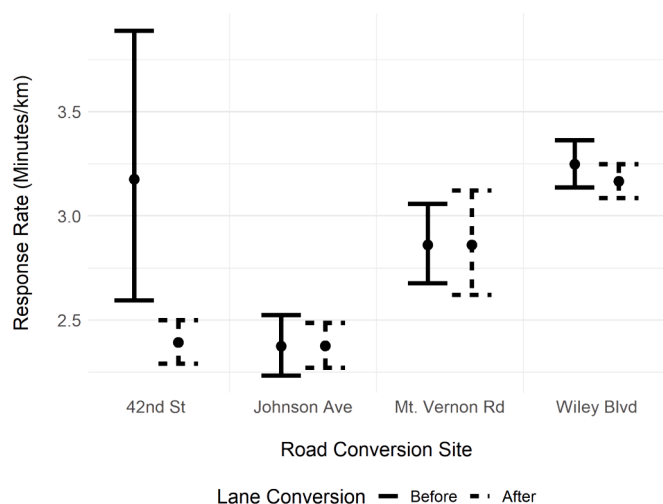
Fig. 4. Emergency response travel rate (min/km) before vs. after road conversion by road segment.