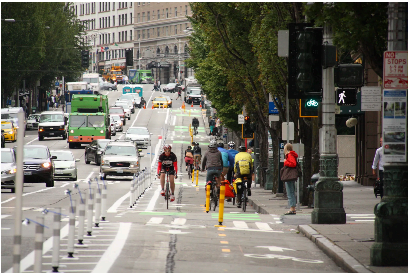
A protected bike lane in Seattle